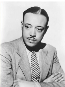
William Grant Still